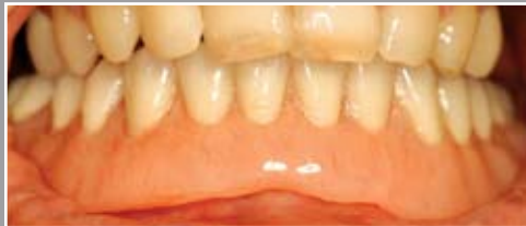
Denture supported by four overdenture implants